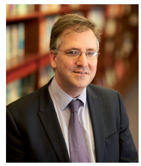
for further information or to arrange to visit the School.

Finally, I encourage you to read the Westcliff Diary (available on the School's website) which lists all of our forthcoming events. We would be very pleased to see you at any of the events. Please contact our CDO Team