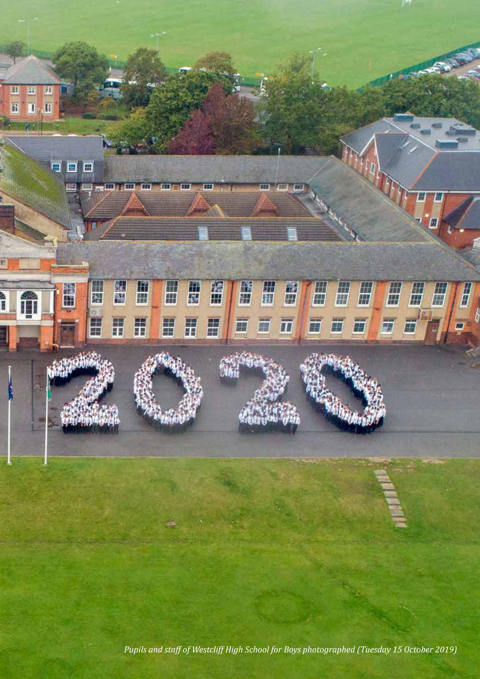
Pupils and staff of Westcliff High School for Boys photographed (Tuesday 15 October 2019)