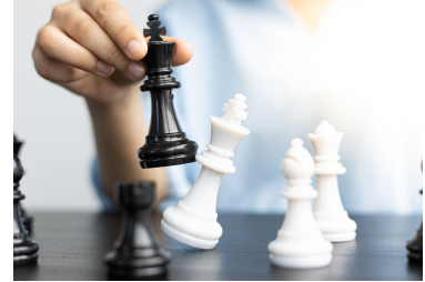
Clubs . . . .