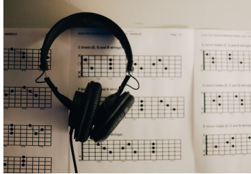
Drama & Music